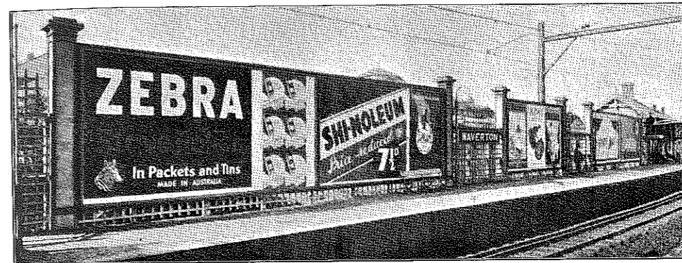
Artistic poster displays on de luxe station hoardings seen by tens of thousands of potential customers every day.

Put YOUR Advertisement where it will be seen.